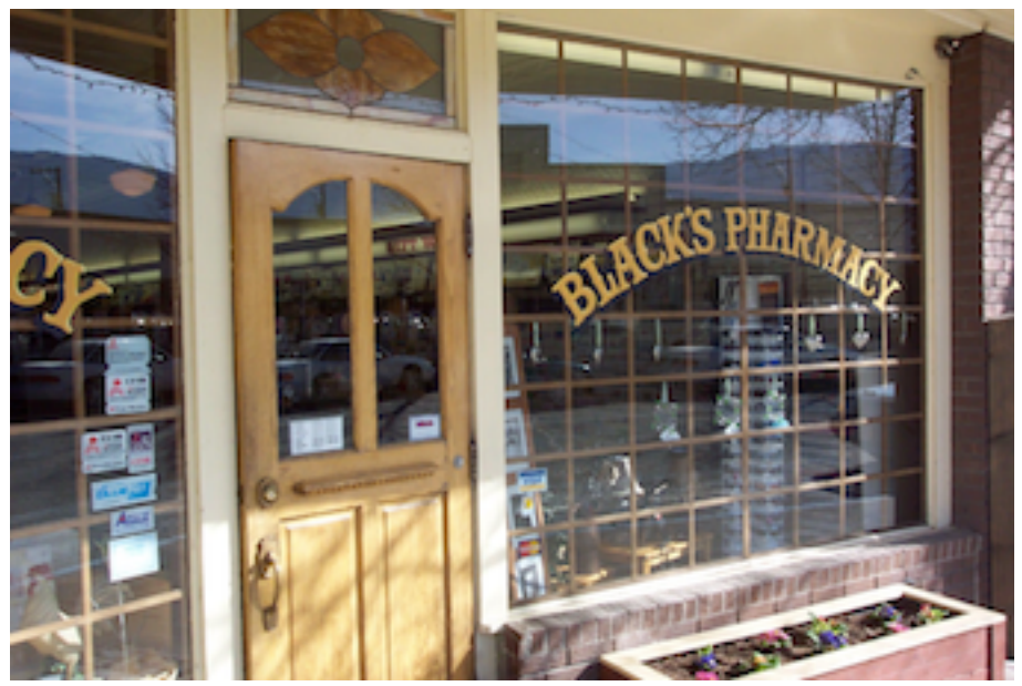
Figure 6: Western façade, Quilchena Street, Merritt.

development agencies have also staged street markets, free concerts, investment tours, and social events to capitalize on the influx of visitors during Mountainfest.