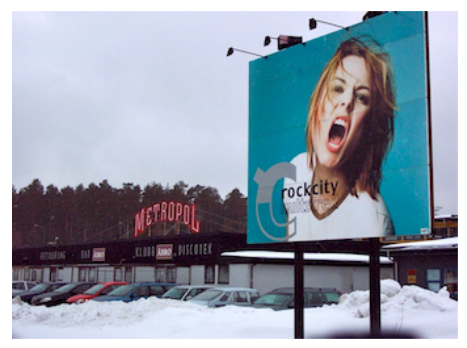
Figure 4: Part of the RockCity complex.