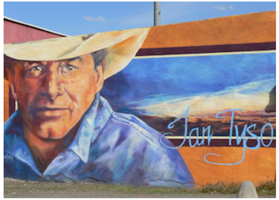
Figure 7: Ian Tyson mural, Merritt.