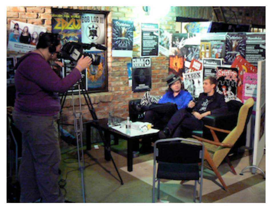
Figure 5: Music management student's interviewing industry professionals during the 2006 Rookie festival, RockCity.

collaboration of, for example, music management students, the music industry, and community associations. As a result, networking opportunities such as RockCity's student run Rookie festival (Figure 5), academic colloquiums held during the Hultsfredfestival, and employment training programs that are coordinated to meet the staffing needs of the sound migration centre and rock archives are central to the model.