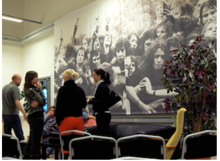
Figure 3: Classroom in RockCity.

Buoyed by initial successes and supported by 5 million Euros from municipal, regional, national, and EU agencies, Rockparty launched the RockCity project in 2000. RockCity was envisioned as a national, creative meeting point that would both host music events and foster industry linkages (Nielsén, Rönnlund, and Svensson; RockCity Hultsfred). The immediate goal was to create a place where educators, students, researchers, entrepreneurs, performers, and music technicians would come into regular contact. The critical component is a music management program run in tandem with the University of Kalmar (now Linneaus University). Other elements include a national development centre for the Swedish music industry (IUC Hultsfred), a business mentorship program (Start Studio), a music summer camp for teenage girls (PopKollo), a music reference library, the Swedish rock archives, the distance education operations of a regional college, and classrooms (Figure 3), computer labs, and recording studios. In 2006, Rockparty and an educational provider called Drivkraft opened a rock music high school. A museum modelled after Seattle's Experience Music Project is also planned. All of these activities save the high school are housed on a former car dealership 2 kilometres north of Hultsfred's core (Figure 4).