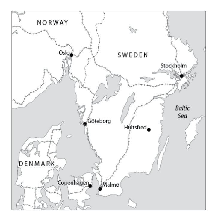
Figure 1: Southern Sweden

Merritt is a small town of 7000 residents (2006). It is located 270 kilometres northeast of Vancouver, British Columbia, Canada in the sparsely populated and resource dependent Nicola Valley (Figure 2). The valley's extensive grasslands and surficial coal beds attracted settlers in the mid 1800s. Since the 1950s, the surrounding pine covered hills and plateaus have sustained the economy. Merritt is home to 5 major sawmills that collectively account for 30% of the labour force. Construction lumber is the standard output, but firms have experimented with value added products such as metric dimensional lumber for Asian markets and naturally blue stained furniture and panelling. The latter is one of the few benefits of the vast pine beetle infestation that has affected 15 million hectares of forest in the interior of BC. In light of uncertainties about the viability of wood industries in the long-term, Merritt has worked to diversify its economic base (Hanna, Dale, and Ling). Notable initiatives include a downtown revitalization plan, new retirement communities, expanded retail and government functions, and country music attractions and related tourist facilities.