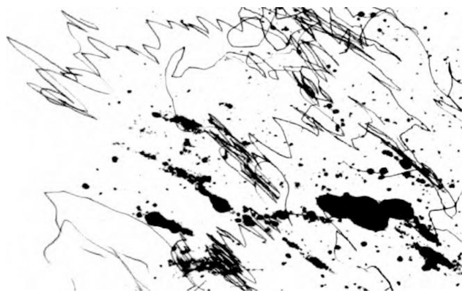
Motion Mapping: Barbara Meneley, 2007

'Motion Mapping' expresses subjective mapping with an intimate focus. With this work, I visually map my own physical and physiological experience of movement. This is a project I've been developing over several years as a passenger on planes, trains and buses using a variety of drawing materials and techniques to visually express the motion of my body. This mapping expresses my intimate and personal experiences of landscape, my own subjective cartography.